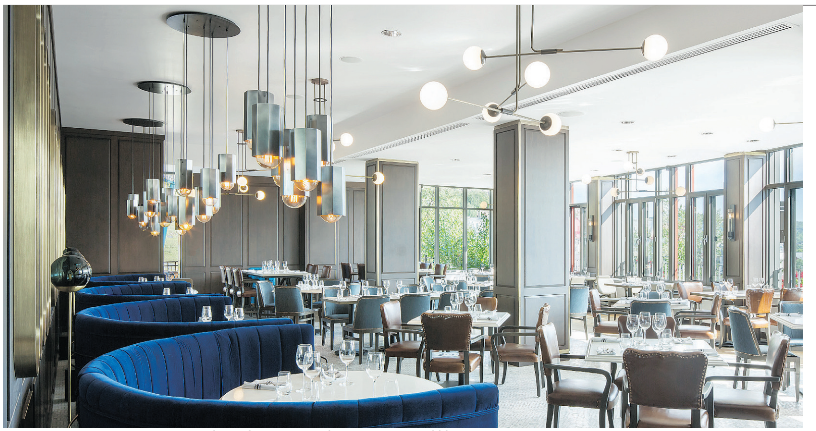
Tremblant's only French bistro, the new Choux Gras Brasserie Culinaire, boasts a 1930s Parisian air.